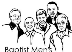
Baptist Men's News

Received to Date: $1,518 2011 Goal: $2,500